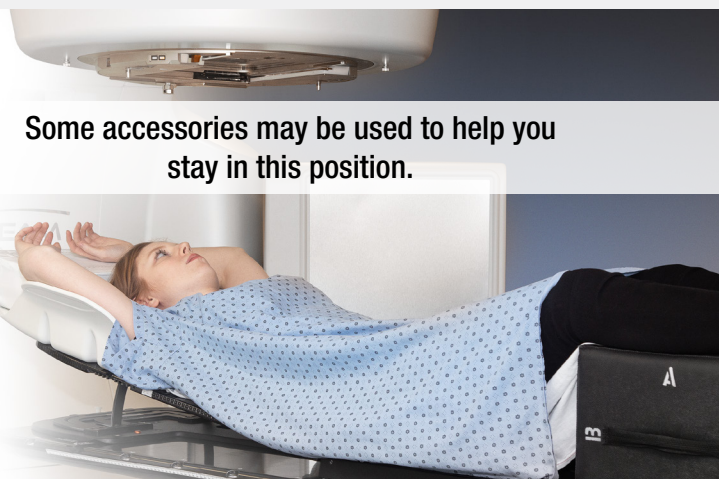
Some accessories may be used to help you stay in this position.

Verification images are taken at each treatment to check your position. They are not meant to see how your tumour is responding to treatment.