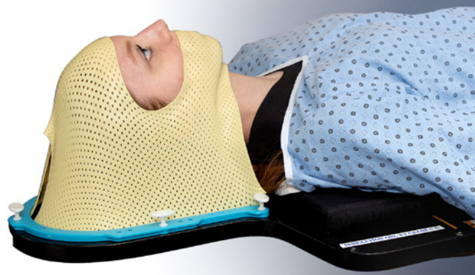
Some accessories may be used to help you stay in this position

After those exams, there will be a delay while the team plans your treatment. The radiation therapists will let you know how long this will take. In all cases, we will adhere to the standards set by the Ministère de la Santé et des Services sociaux. You will be notified by phone of the date and time of your first treatment. Treatments can begin any day of the week.